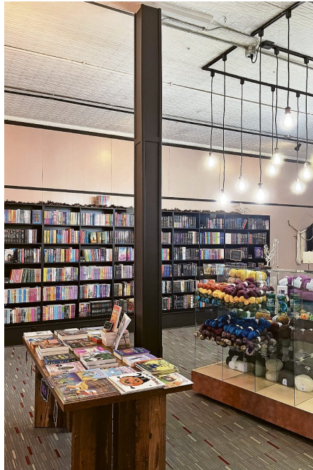
The historic building has high ceilings.