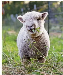
Lily the family sheep