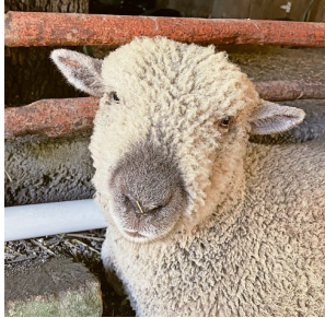
Reggie the family sheep