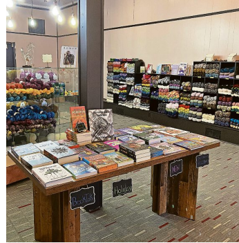
The new shop has a wide variety of yarn and romance novels.

Ironically, Lynn says, the building at 123 N. Sale St.