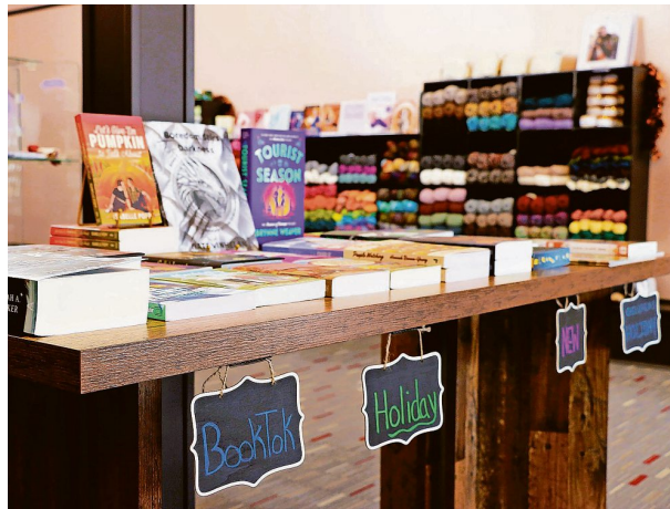
Books are organized for shoppers.