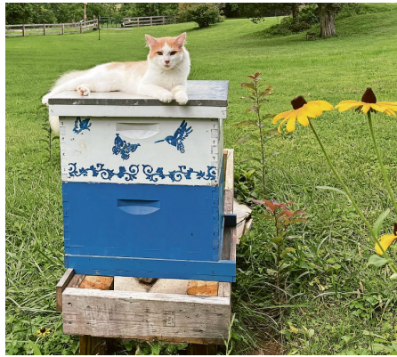
Herbie the family cat and the honey bees