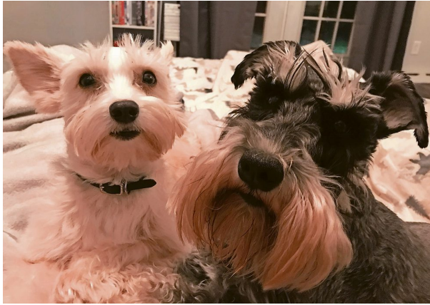
Pickles on left and Elmer, the family dogs