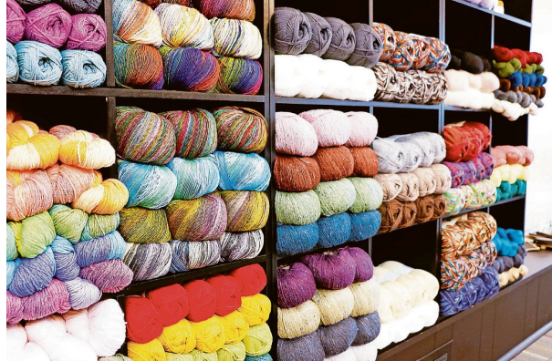
A wide variety of yarn is offered at Knitting Romance.