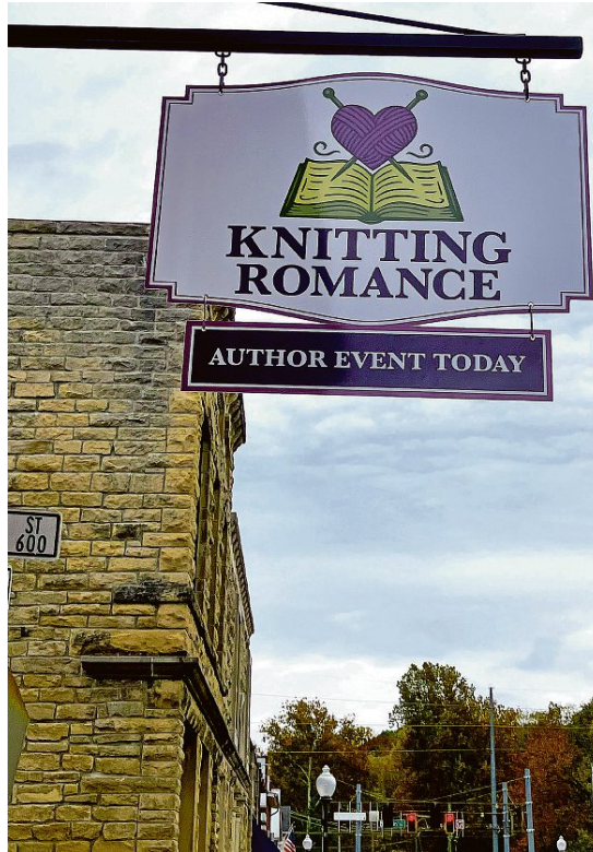
Knitting Romance opened Oct. 17 in Ellettsville.

"I get the majority of books from a wholesale company named Ingram. I also get books